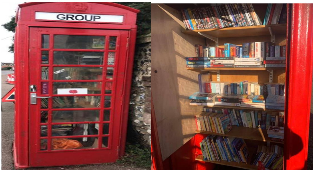
Box outside the Library.

A request was made to only take 1 or 2 DVDs at a time and return when finished. This was because the Beavers had put a whole box in there which was taken (including the box)!