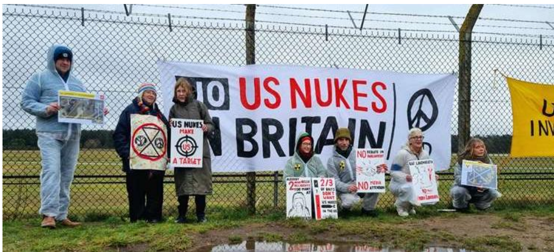
Some of the CND protesters at RAF Lakenheath.

The Doomsday Clock, maintained since 1947, is said to show the likelihood of a human-made global catastrophe in the opinion of the members of the Bulletin of the Atomic Scientists.