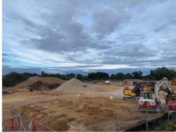
Above: (Left) Boreholes being drilled for the Ground Source Heat Pump