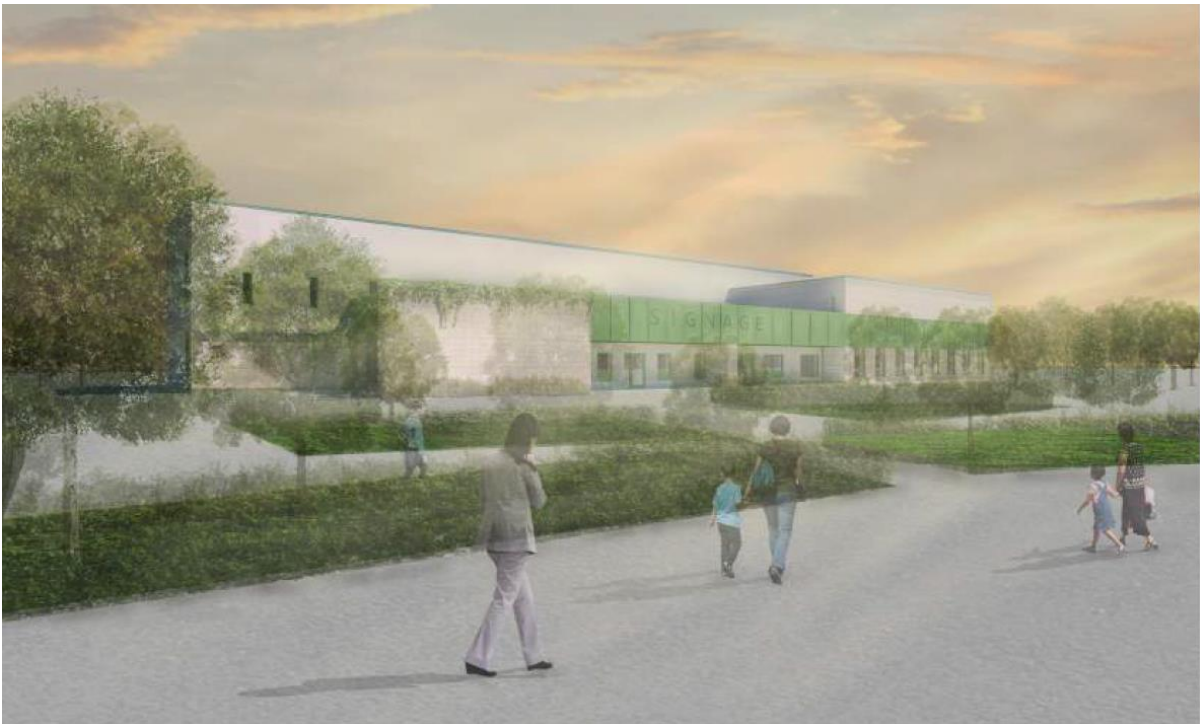
Concept of the new school which is the first net zero operational school in Suffolk.