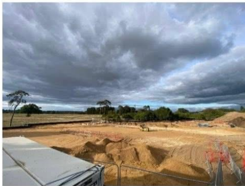
Above: (Left) Car Park area being built up

I have attached some progress photos below: